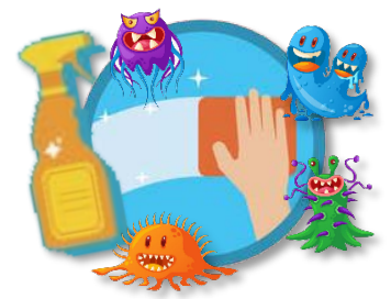
CLEAN AND DISINFECT FREQUENTLY TOUCHED OBJECTS AND SURFACES USING A REGULAR HOUSEHOLD CLEANING SPRAY OR WIPE.

AVOID TOUCHING YOUR EYES, NOSE AND MOUTH WITH UNWASHED HANDS.